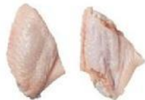
Chicken Middle Wings

Chicken Middle Wings: Origin Alitas de pollo medio: Origen